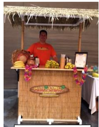
Tiki Counter with