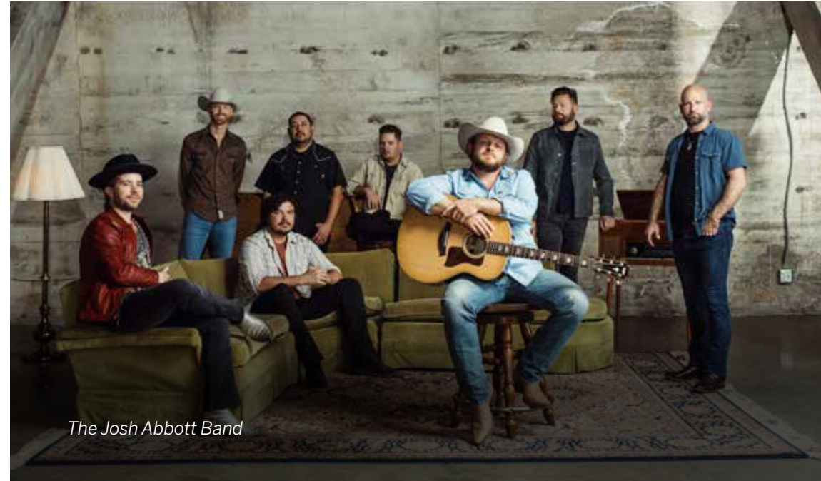
The Josh Abbott Band